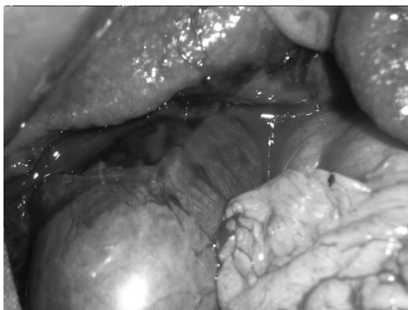
Fig. 2 Gallbladder avulsion with hematoma from liver bed.

injury. Further exploration of the abdomen showed neither injury to the hepatoduodenal ligament nor bile leak. Cholecystectomy was performed. The abdomen was cleaned, drained, and closed in layers. The patient's postoperative course was uneventful.